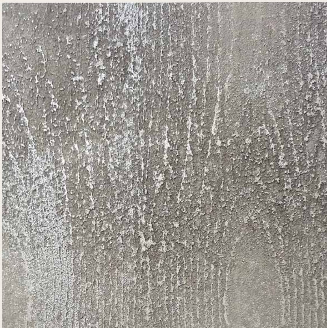
CONCRETE by Novacolor 4654 PC2010 & FASE SILOSSANICA FS 6101 & RUSTON METAL SILVER

Ergiebigkeit: 1,6-2 Kg/m 2 in zwei Schichten. Für weitere Infos bitte siehe Technisches Merkblatt.