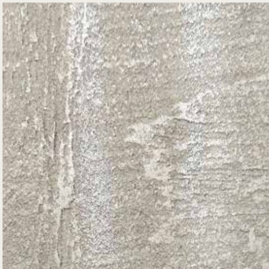
CONCRETE by Novacolor BIANCO & FS 6101 & RUSTON METAL SILVER