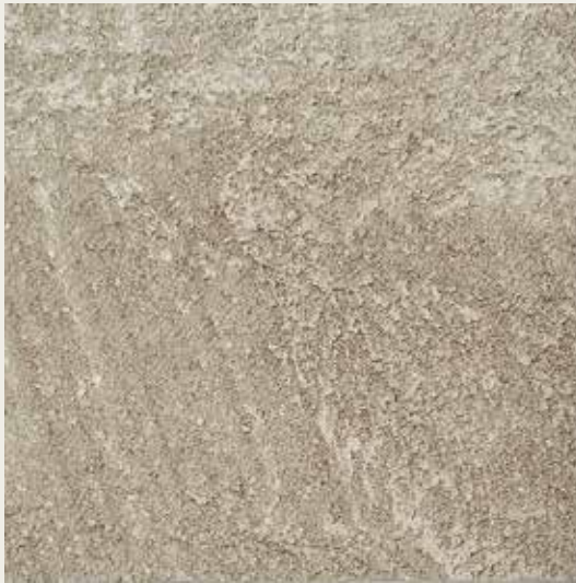
CONCRETE by Novacolor 4654 PC 2010 & FS 6101 & FS 6110