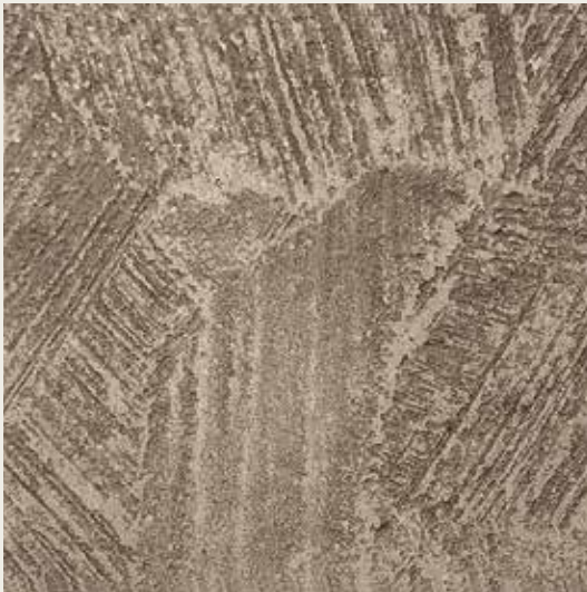
CONCRETE by Novacolor 17007 & FS 6112